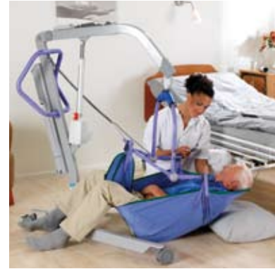
A single caregiver can safely raise a resident from the floor.