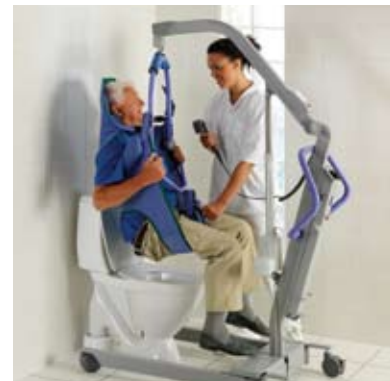
Chassis adjustment enables optimum lift positioning for toileting.