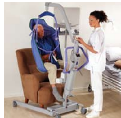
The electronic scale option saves the caregiver's valuable time.