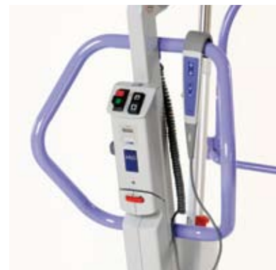
Operate efficiently via the handset or mast control panel. Ergonomically designed push/pull handles for smooth maneuvers.