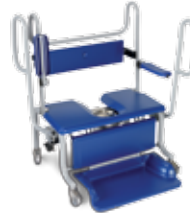
Bariatric hygiene Dignified everyday showering and toileting routines