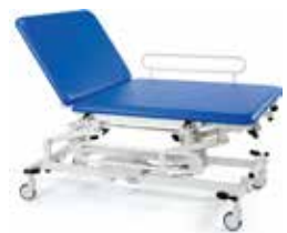
Furniture Space for patients and caregivers