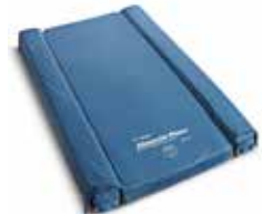
Support surfaces Enhanced care for compromised skin