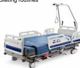
Bed frames A safe and dignified environment