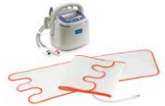
VTE prevention Comfortable, convenient and clinically effective