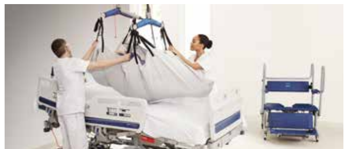
Training Caregiver safety – patient comfort and dignity