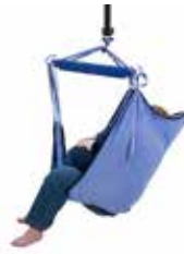
Safe patient handling Streamlined ergonomic efficiency