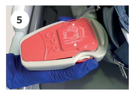
Release CPR by squeezing the sides