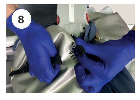
Use buckles to secure the mattress