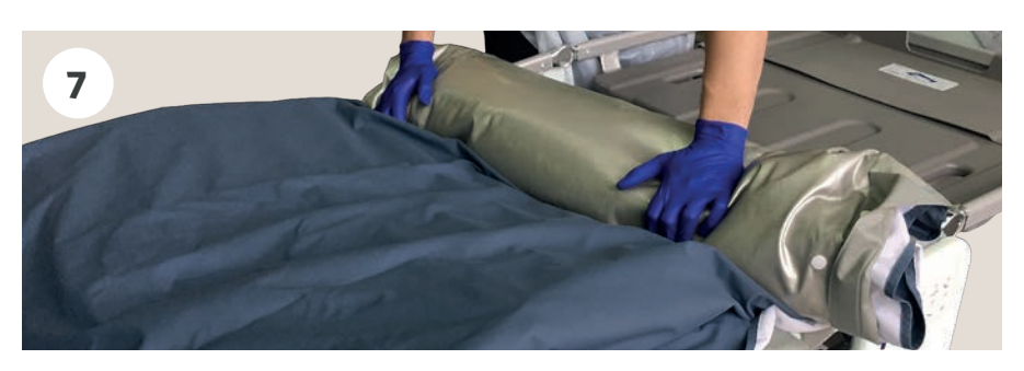
Place tubeset on mattress and roll from the foot end towards the head end (roll it once to expel majority of the air, then retry rolling it to achieve a tighter roll)