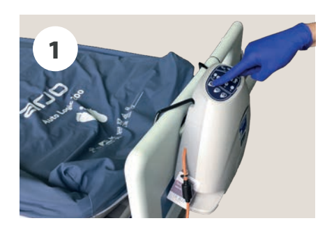
Hold down power button to switch off pump