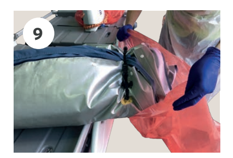
Bag mattress and pump