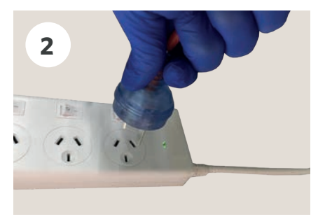
Disconnect power cable from socket