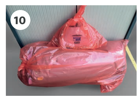
Place the pump on top of the mattress in your designated collection area

For more information call Arjo Rental: 1800 00 7368 or email: customerservice-au@arjo.com