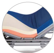
SUITABLE FOR PROFILING BEDS Suitable for use in the gatched or supine position