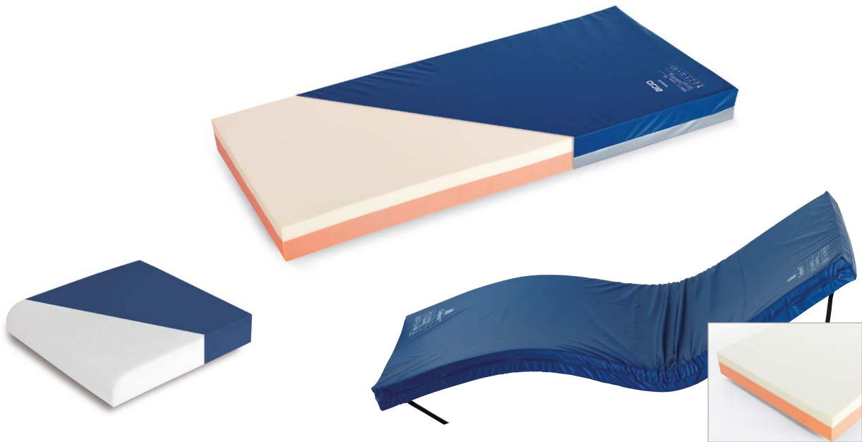
24 Hour Care Package Seat cushion available

The ConformX range has been designed to provide a 24 hour care solution. The range includes a mattress replacement, mattress overlay and seat cushion. The ConformX range is available in various sizes and is easy to maintain due to the durability of the cover and foam.