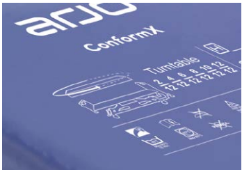
TurnTable Guide - All ConformX mattress replacement systems carry the TurnTable Guide