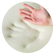
MEMORY FOAM Gently moulds to patient's body