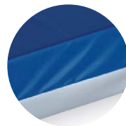
SILVER BASE MATERIAL Offering non slip properties