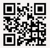
IndiGo Demonstration Video