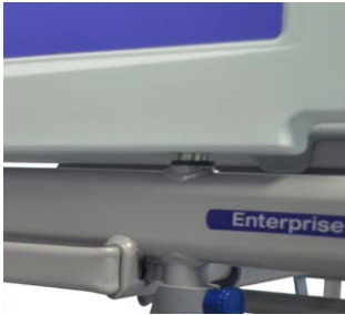
Head/Foot panel locks