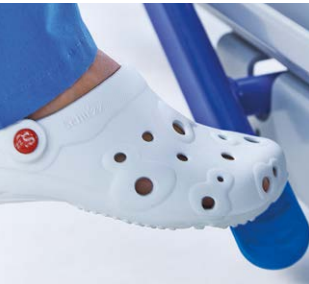
Non powered 5th wheel