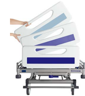
Panel colour options