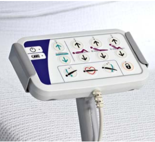
Foot end attendant control panel