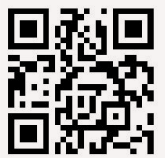
Enterprise Range Demonstration Video