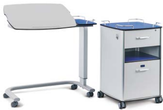
Bed side furniture