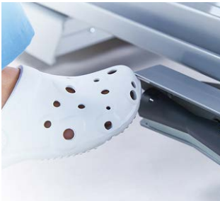
Variable height foot switch