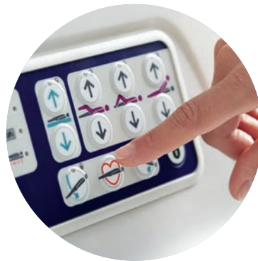
Access to innovative technologies from Arjo