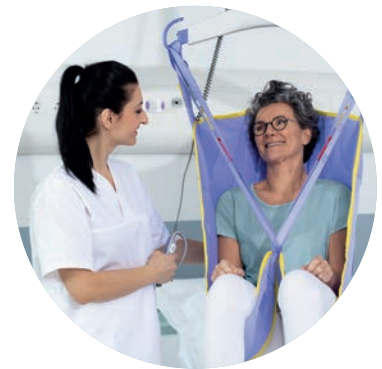
Secure and efficient